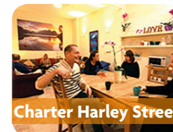
Charter Harley Street

Admissions Team: 01736 850006 info@bosencefarm.com Bosence offers rehabilitation using the 12 step model, detox and stabilisation to anyone aged 18 or over – details at www.bosencefarm.co.uk 69 Bosence Rd, Townshend, Hayle TR27 6AN.