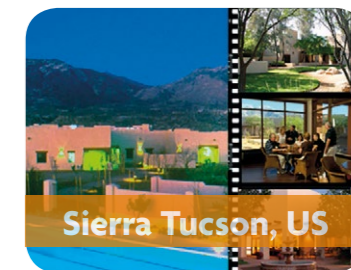
Sierra Tucson, US

Admissions: +351 919357186 email form on website English speaking, individualised 12-step recovery treatment from professionals trained at the Priory – details at www.novavidarecovery.com Located 25 minutes' drive from the main airport at Faro.