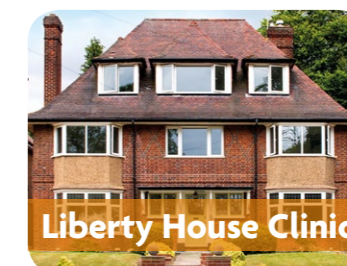
Liberty House Clinic

Admissions: 020-7701 8130 Kairos.bethwin@kairoscommunity.org.uk Kairos Residential also links to detox, day programme, aftercare. www.kairoscommunity.org.uk/treatment-services/residential-rehab 59 Bethwin Road, Camberwell, London SE5 0XT.