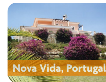
Nova Vida, Portugal

Admissions: +1 866.313.6310 info@ashleytreatment.org Substance abuse programmes include: primary, relapse prevention, young adults and pain recovery programmes. www.ashleytreatment.org 800 Tydings Lane, Havre de Grace, Maryland 21078.